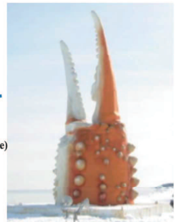
Crab scissors object